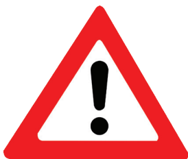
Illustration © Marc Dando

If accidentally caught, this species shall not be harmed. Specimens shall be promptly released, with details recorded in vessel logbook. 2